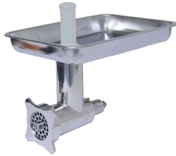
SS812HCPL Meat Grinder Attachment