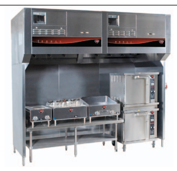
Model WVU-96 (equipment sold seaparately)