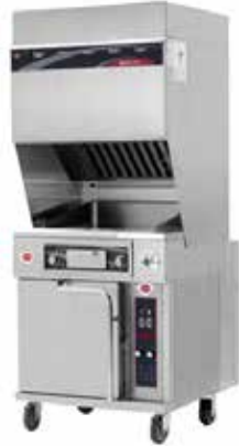
Model WVOG136 SHOWN