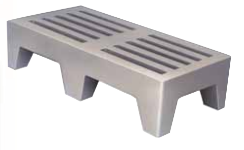
Super Capacity, Super Sanitary! Ideal for Coolers, Freezers and In-Store Display Areas! Also Ideal for Outdoor Storage!