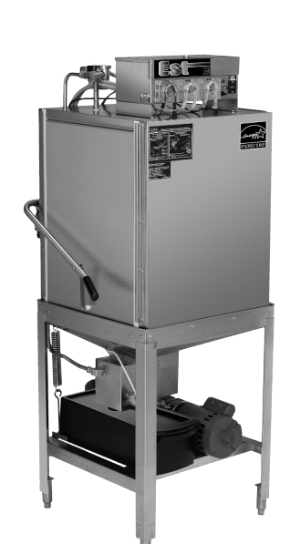
MODEL EST-AH-EXT (Tall) (20-1/2" DISH CLEARANCE)